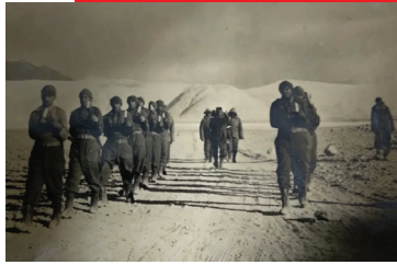
Indian soldiers giving a guard of honour to the mortal remains of Major Shaitan Singh in Choushal, in February 1963