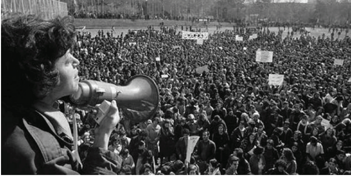
An Iranian woman without hijab addresses demonstrators for equal rights for women in 1979.

“Forced veiling was unpopular with many Iranian women from the beginning.”